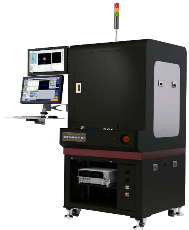
MPI wafer/chip prober.